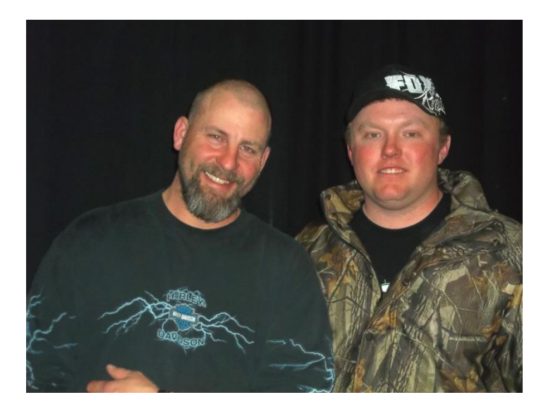
501 Doubles Level 3 – 2<sup>nd</sup> – 2 Nails In A Bucket