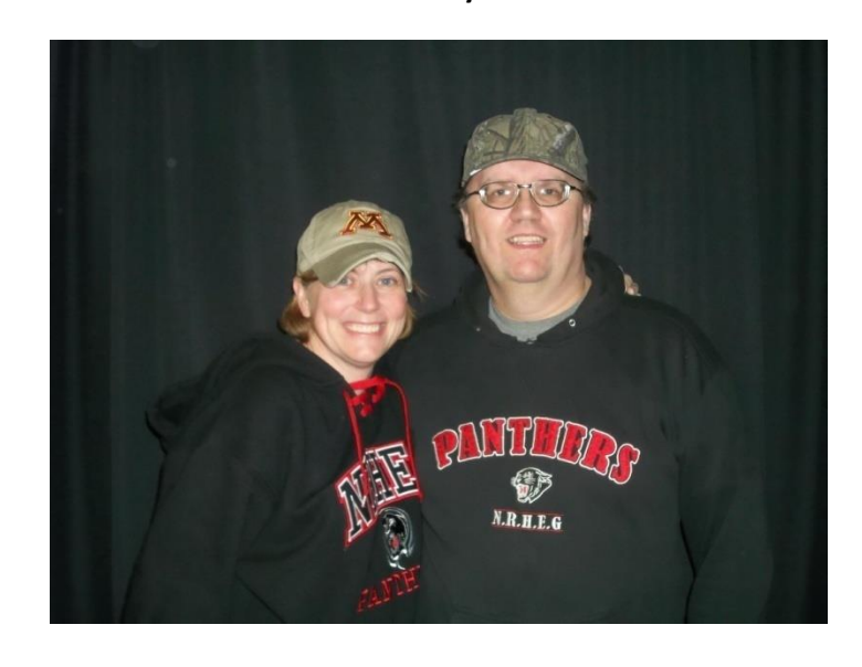
501 Doubles Level 6 – Owatonna Eagles