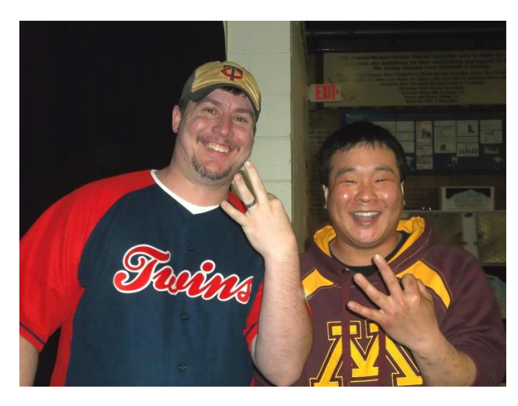
501 Doubles Level 4 – 2<sup>nd</sup> – Knee Deep