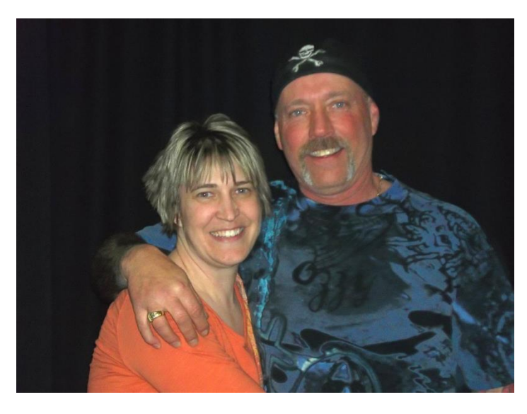
501 Doubles Level 5 – 1<sup>st</sup> – Lindy's