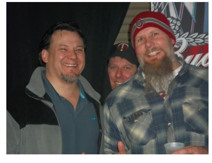
501 Doubles Level 1 – 2<sup>nd</sup> – Live Action!