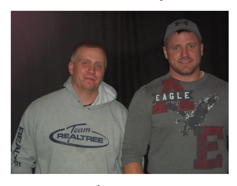
501 Doubles Level 8 – 1<sup>st</sup> – Daddy's 2-B