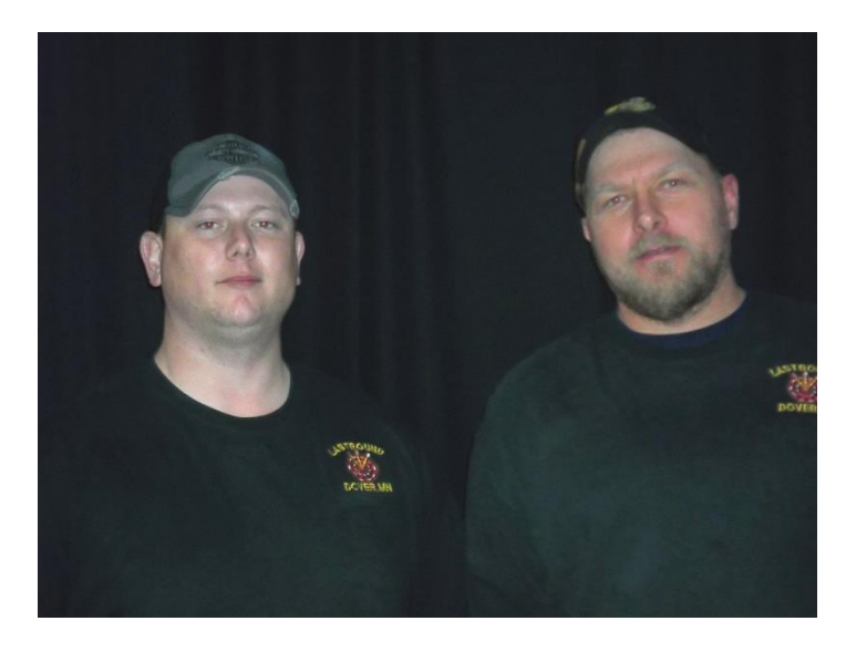
501 Doubles Level 9 – 1<sup>st</sup> – 3's & 2's